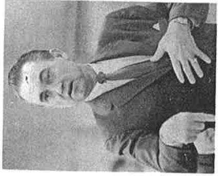
George Wallace Speaks Out On America's Social Ills