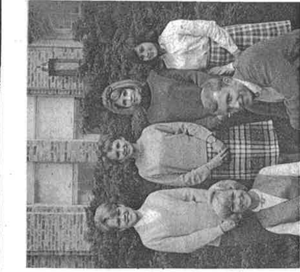
Q U E E N