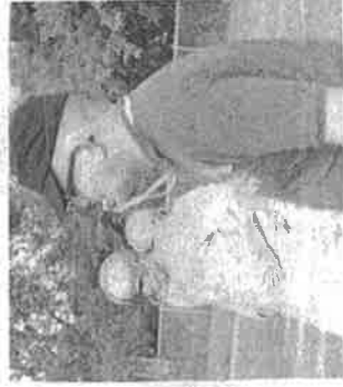
Coach keeps eagle eye on team.

THE AQUA SHOP Skin & Scuba Equipment Inventory Sale. Items Like Professional Swim Fins Sizes 7-Super Extra Large Were $13.95 Now $7.95 Competition Masks with Tempered Lens Were $6.95 Now $5.25. Wetsuits Reg. $47.95 Now $32.50. Used and New Tanks, Regulators, Back Packs at Tremendous Savings. Contact Dave Wyse or Call 275-8879