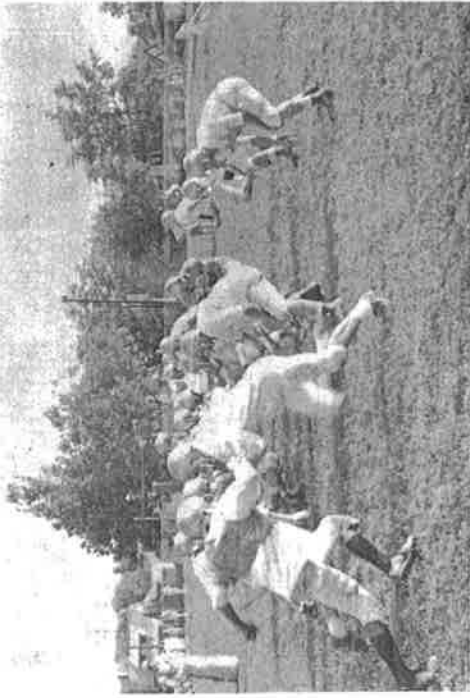
Team scrimmages to time up plays for perfection to bomb the Wilbur Wright Pilots.

Compliments Of . . . . . RIVERVIEW CLEANERS 2200 N. Gettysburg for prompt, courteous delivery Call 277-6576